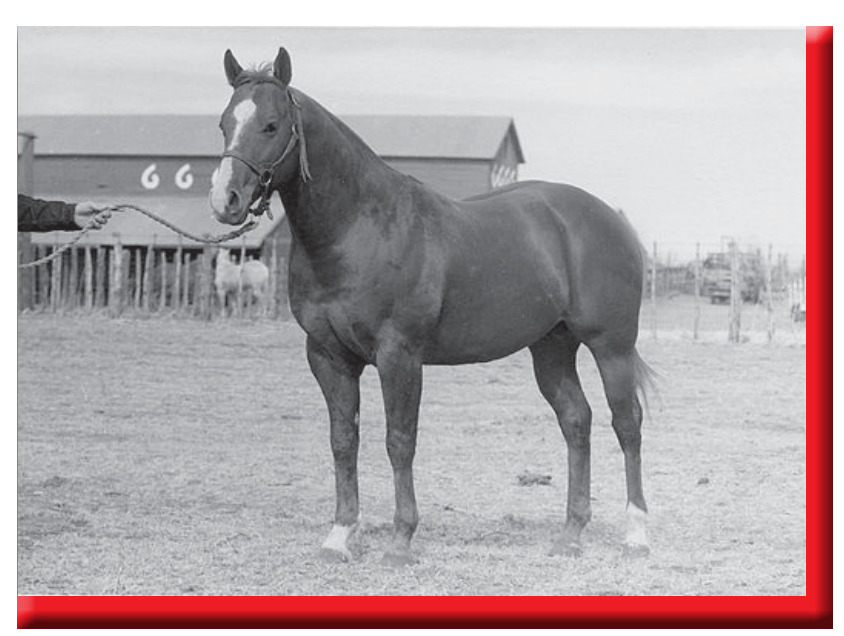
Cee Bars stands in front of the famous 6666 barn.