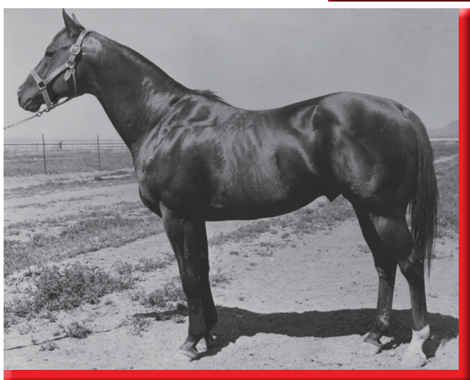
Three Bars and Chicaro (above right) are two thoroughbreds that came together to make a great contribution to the quarter horse with horses like Cee Bars.

Three Bars photo Courtesy The American Quarter Horse Journal Chicaro Photo Courtesy The AQHA Hall of Fame and Museum.