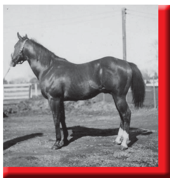
Chicaro Bill is the broodmare sire of not only Three Bars but Triple Chick, Three Chicks and The Ole Man.

The 1958 foal crop of Cee Bars had only five foals make it to the show pen and four of them were money and/or point earners. This includes the ROM performers Cee Bar Lady 71 and Cee Bars Miss 73.